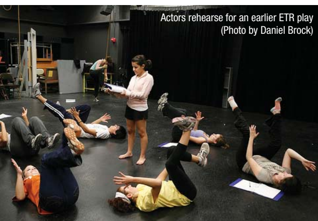
Actors rehearse for an earlier ETR play

BRACE YOURSELVES FOR THE ARRIVAL OF TUTTO THEATRE COMPANY IN ROME THIS SUMMER, ALL THE WAY FROM AUSTIN TEXAS. IN WHAT CAN ALMOST BE DESCRIBED AS A 'TRAVELLING CIRCUS', ACCLAIMED DIRECTOR DUSTIN WILLS RETURNS WITH AN UNFINISHED SCRIPT AND WITH HIS USUAL MAGIC TRICKS UP HIS SLEEVE INCLUDING A TRUNK FULL OF ACTORS TO PERFORM A TYPE OF THEATRE THAT HAS YET TO BE SEEN BY ROMAN AUDIENCES.